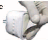
Placement Option 2